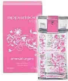
APPARITION PINK Ungaro