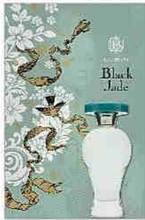
BLACK JADE Lubin