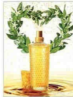
MIEL & CITRON L'Occitane