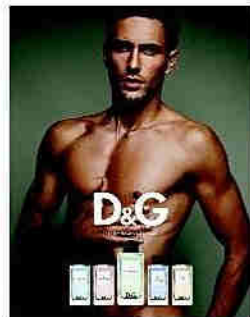
N°6 L'AMOUREUX D&G