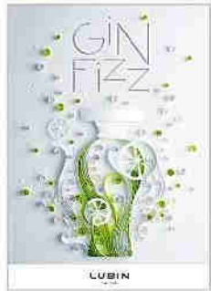
GIN FIZZ Lubin