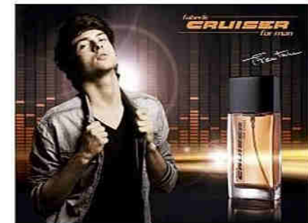
CRUISER MAN Faberlic