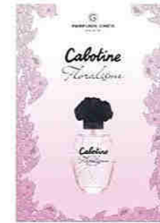
CABOTINE FLORISSIME Grès